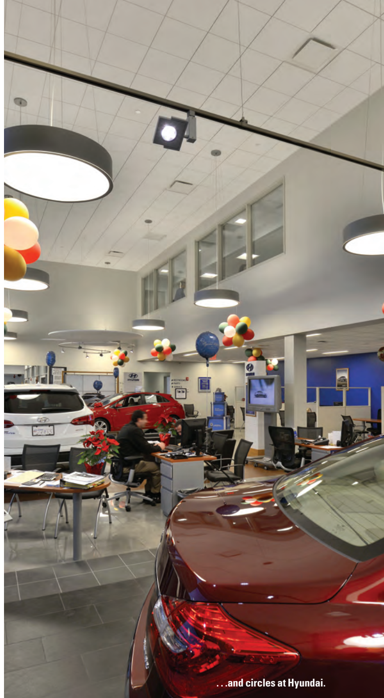
...and circles at Hyundai.