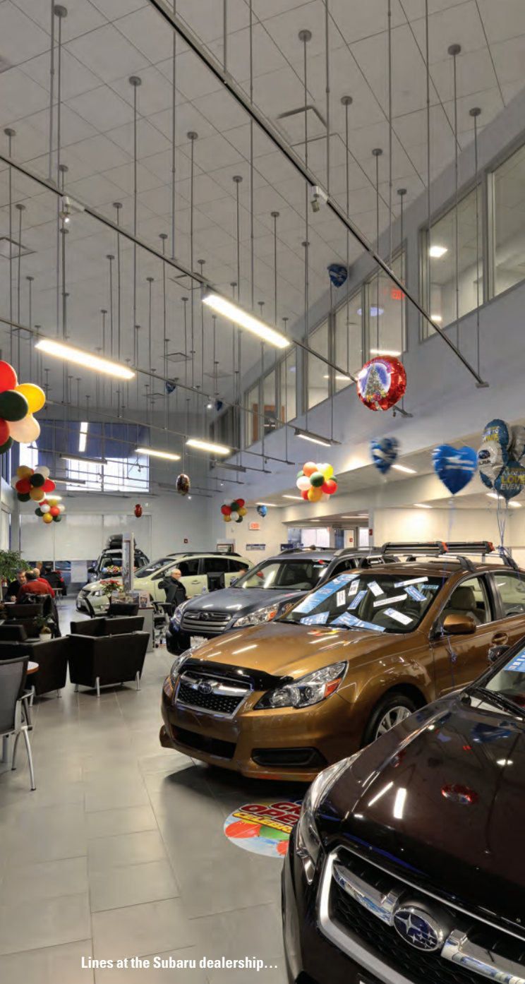
Lines at the Subaru dealership...