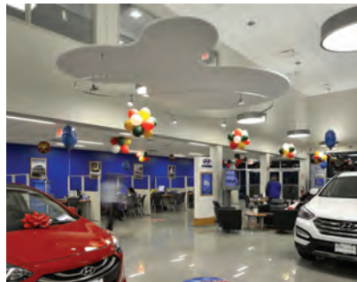
The fixture layout had to accommodate a hanging gold fish-style ceiling element required by Hyundai corporate.

The Hyundai showroom was the more difficult design for two reasons. First, the project team had to work around LED track heads that are the corporate standard for highlighting "showcase cars," says Whitehouse. The mandated linear track was a main reason why the circular dome luminaires (each containing four 40-W CFL bi-x lamps) were used in the Hyundai space. If Whitehouse had used linear luminaires in this showroom, the two lighting systems