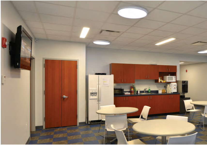
Lines and circle converge in the employee cafe. The circular daylighting units bring in natural light.